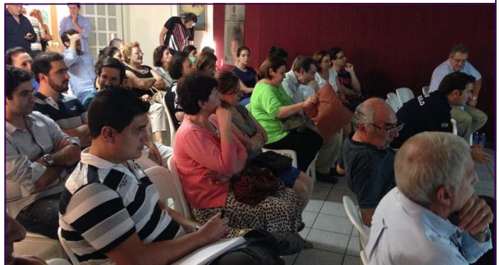
General Public Attending AVC Presentation in Sao Paulo